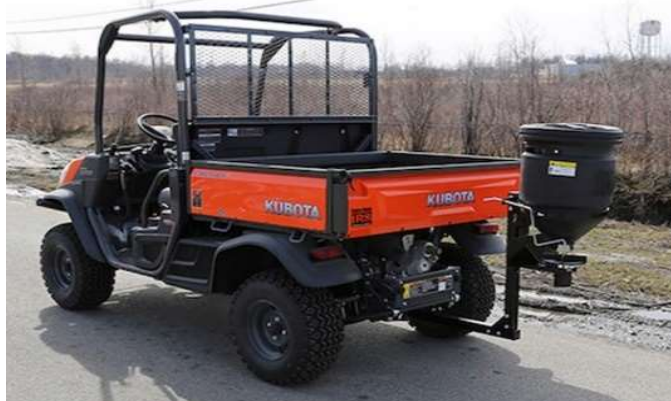
ATVS16 Capacity lt 60