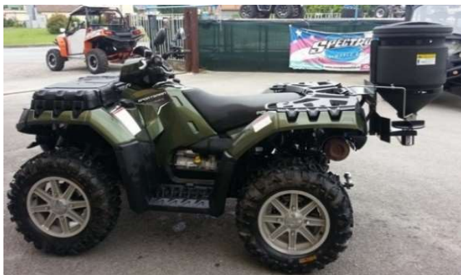
ATVS15A Capacity lt 60

The SaltDogg® spreaders of the ATVS series are completely independent and ultra-durable, the main structure is in anti-corrosion polyethylene. The robust design allows the use of salt or a salt/sand mixture. They are easily mounted on small vehicles.